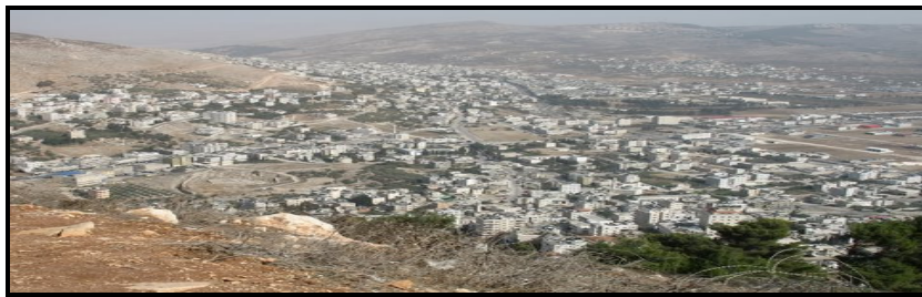
Shechem in the region of Samaria Standing on Mount Gerizim (Blessing). Upper left corner is Mount Ebal (Curse). Shechem is in the middle with Elon Moreh in the background.

🌿 “To your offspring I will give this land” (Genesis 12:7).